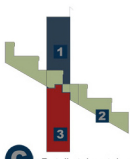
C Detail stair - stair walls